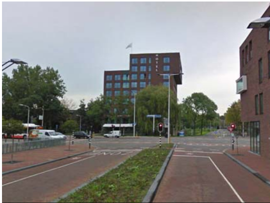
Hampshire Delft Centre

Number for emergencies: Karel Mulder: +31-6-29053564, or Tijn de Jonge, +31-6-57705776 Karel's office: +31-15-2781043/2783791